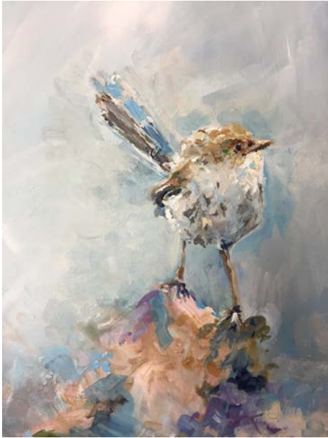
Wren, 16 x 20, Acrylic ~ Fayetteville mural