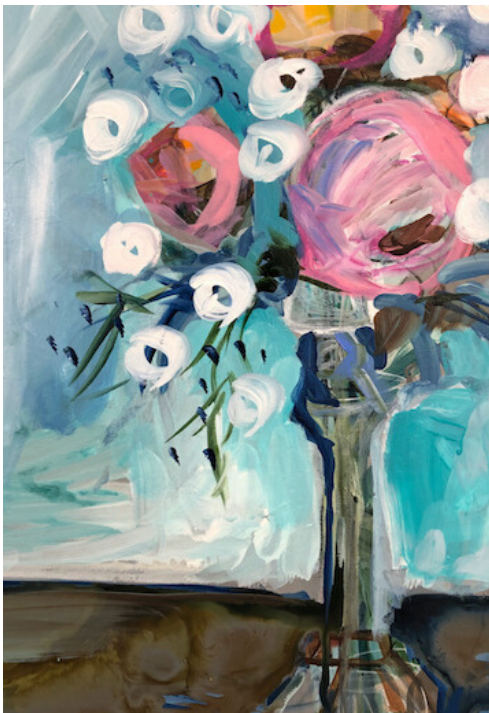
Coral Carnations, 12 x 16, Digital

When I create florals, I strive to capture the essence rather than an exact reproduction. Flowers have the ability to brighten a space while creating an atmosphere of excitement. My goal is to connect the viewer with a memory.