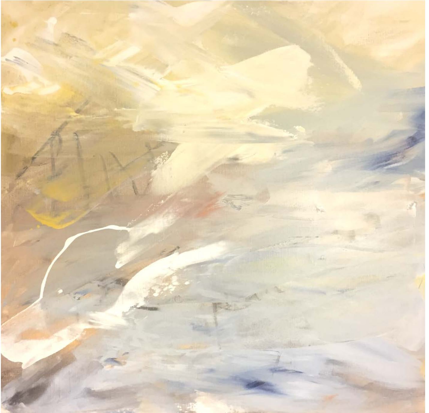
Thrive, 36 x 36, Acrylic