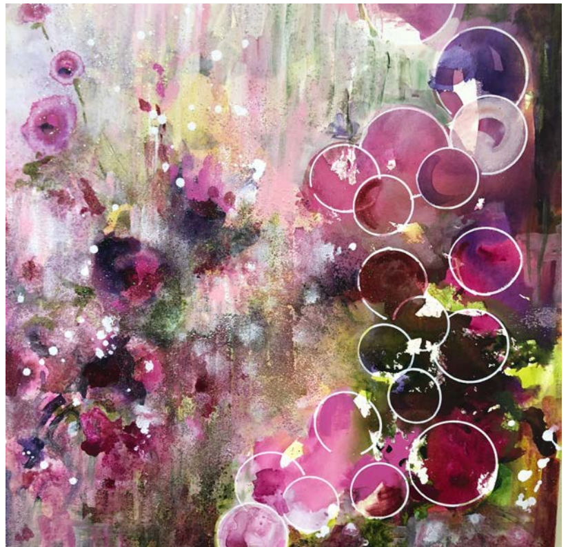
Organic to Geometrics, 36 x 36, Acrylic

"Abstract Florals connect with the viewer. They can see what their other senses would hear, touch smell and taste."