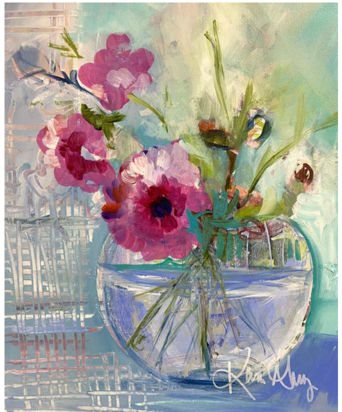
Peach Roses, 816x 20, acrylic