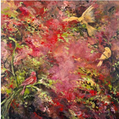
Tanagers , 36 x 36, Acrylic