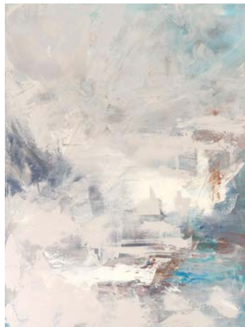
Planet X, 20 x 20, acrylic