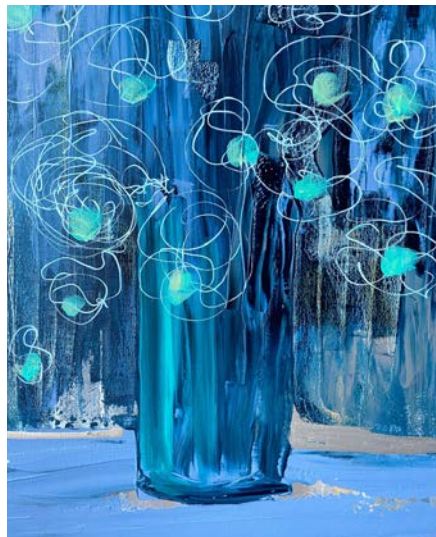
Weisman Vase, 16x 20, acrylic