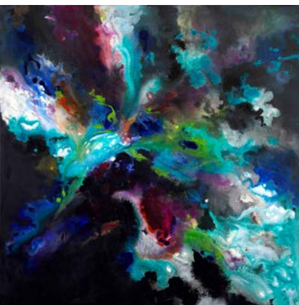
Thunderstorm , 40 x 40, Acrylic