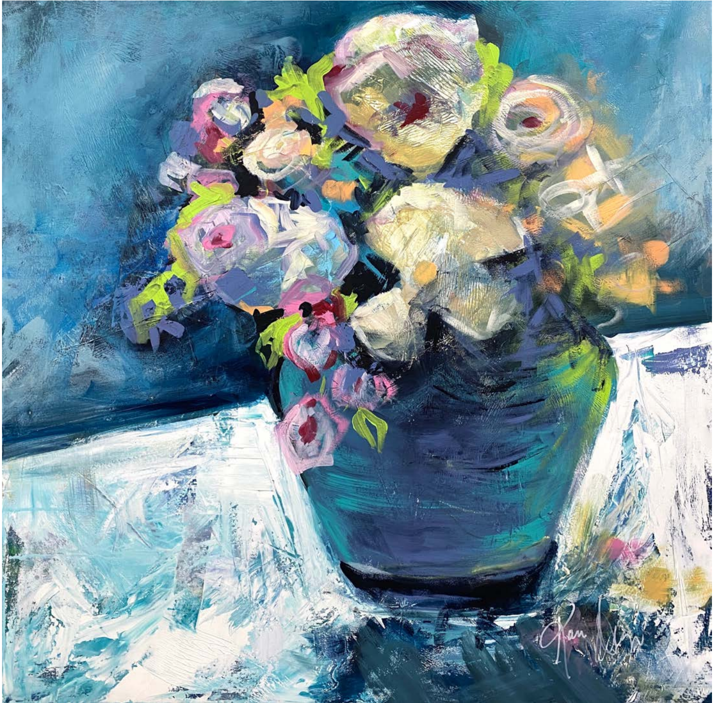
Blue Roses Overdrive, 48 x 48, Acrylic