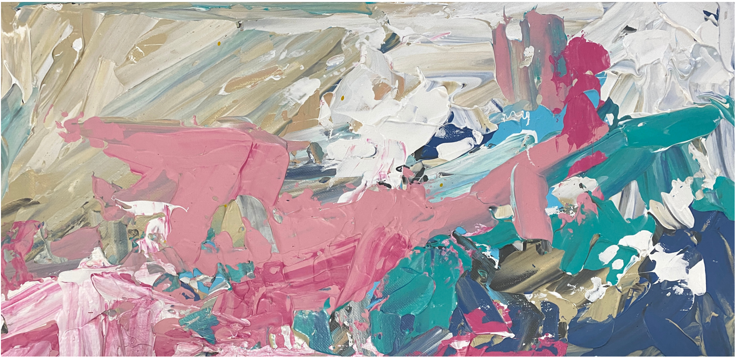
Calm, 20 x 20, acrylic